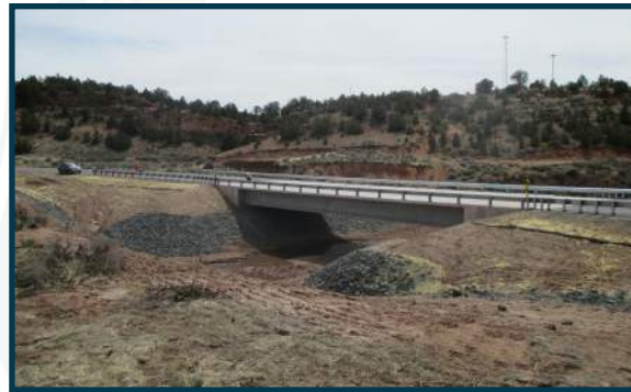
Location: Kinlichee, AZ Client: BIA Project: Cast-in-Place Bridge w/ Erosion Protection