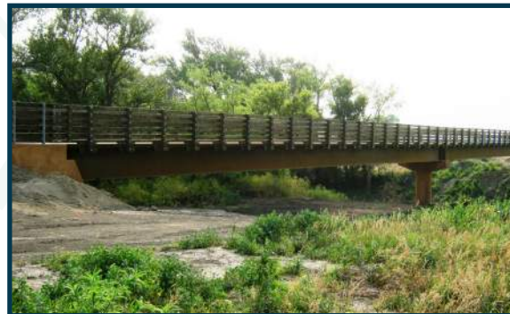
Location: Larned, KS Client: Federal Highway Administration Project: Fort Larned Natl. Historic Site, Wood Bridge