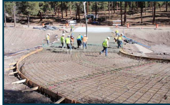
Location: Santa Clara, NM Client: Federal Highway Administration Project: Concrete Rigid Paving